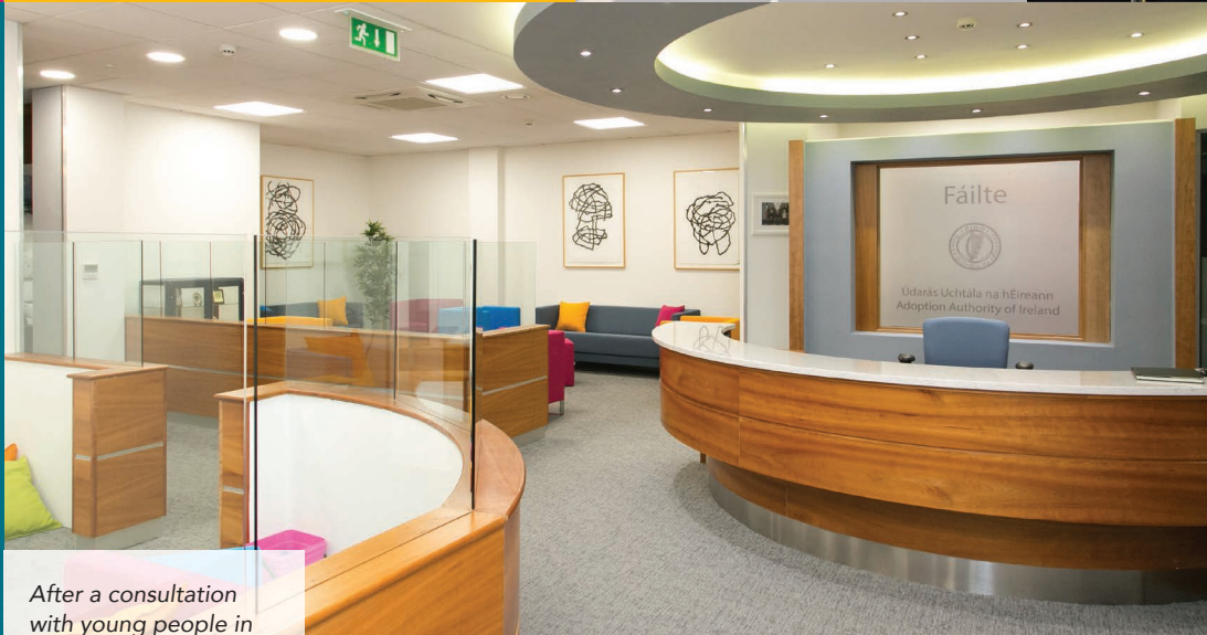
After a consultation with young people in 2016, the AAI designed new family-friendly waiting areas and spaces within their offices at Shelbourne House.