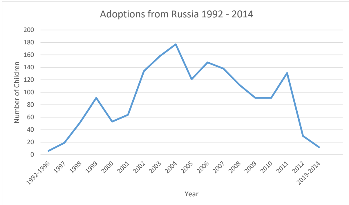
Figure 1: Adoptions from Russia into Ireland by year, 1992 – 2014

Alongside the Adoption Act 2010, the ratification of the Hague Convention on Intercountry Adoption brought a number of changes into how adoption was regulated and managed in Ireland from 2010 onwards. This strongly impacted the ICA figures from all countries going forward. 1413 children were adopted from Russia into Ireland between 1992 and October 2010, while a further 215 were adopted between November 2010 and April 2014, after the new legislation.